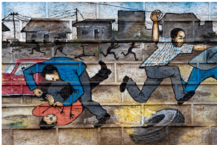
Kenya, Nairobi. A mural in the Kibera slum depicting urban violence.

Community policing is a central aspect of arms control and the prevention and reduction of violence linked to gangs and organized crime. Police reform has led to a more community-oriented policing strategy based on the acknowledgement that ‘security is a task for all’ (Dammert, 2009, p. 122). This shift represents a departure from control-oriented policing towards the inclusion of prevention mechanisms in local security plans (Dammert, 2009, p. 139). On the one hand, this approach to policing promotes a rapprochement between the police and communities; on the other hand, it encourages associative relations with the broader community—including its business associations, local clubs, and unions