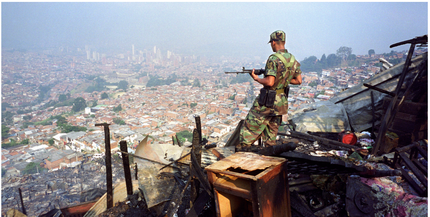
Colombia, Medellín, Antioquia. A soldier stands amongst the burnt remains of the settlement of displaced families.

F or the first time in history the majority of the world's population resides in urban centres. It is also estimated that virtually all population growth over the next 25 to 30 years will occur in cities (UN-HABITAT, 2008a, p. ix). 2 But as urban areas have grown, so has the problem of urban armed violence. While urban areas are not necessarily more violent or less safe than rural areas, their size concentrates perpetrators and victims of violence (OECD, 2011, p. 13; World Bank, 2011a, p. 17). 3