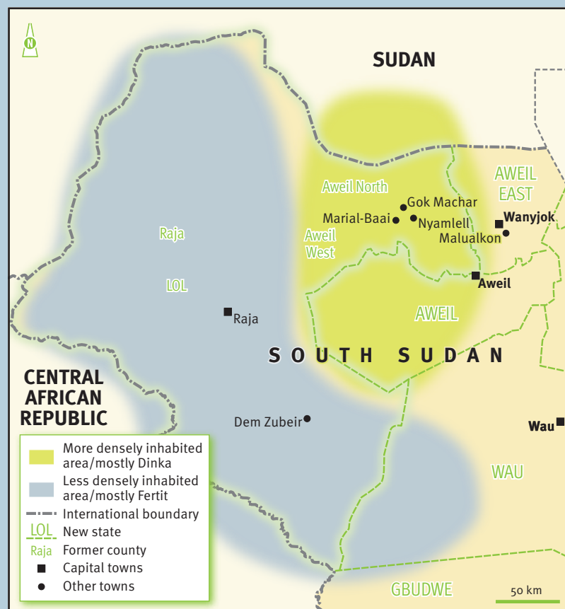
Map 3 The demographic balance of Lol state, 2018