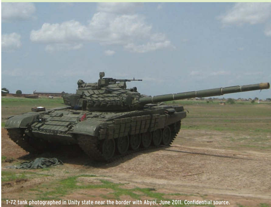
T-72 tank photographed in Unity state near the border with Abyei, June 2011.

Segments of the consignment have been delivered to South Sudan since mid-2009. Satellite imagery has shown that an initial shipment of T-72 tanks arrived at an SPLA facility Juba in May 2009. 33 In September 2011, 20 T-72 tanks were spotted being transported on the road from Nimule—a town bordering Uganda—toward Juba, and in November at least 12 T-72 tanks were parked next to SPLA barracks just outside Juba on the road from Uganda. 34 By late November 2011, the last remaining T-72 tanks from the MV Faina had been delivered. 35 Most of them have since been deployed in Mayom, Unity state, less than 100 km from South Kordofan.