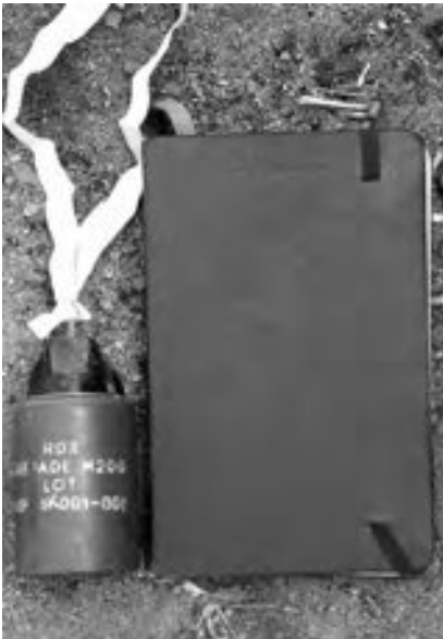
M20G sub-munition observed in South Kordofan, May 2012.

after they were fired over Troji on 29 February 2012. These testimonies, corroborating other reports that circulated in April 116 and May 2012, 117 confirm the use of cluster bombs by the Sudanese Air Force over the Nuba Mountains, despite official denials by Khartoum. 118