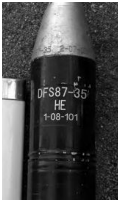
7.62x54R mm and 12.7x108 mm ammunition and DFS87 and DFJ87 grenades observed in South Kordofan, May 2012.