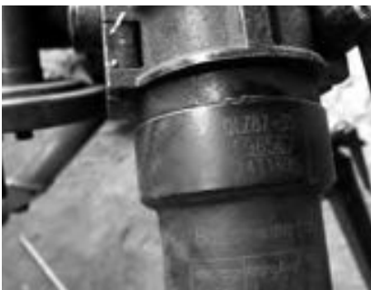
QLZ-87 grenade-launchers observed in South Kordofan, May 2012.