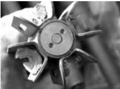
60 mm and 81 mm mortar bombs with Farsi markings, suggesting Iranian origin, observed in South Kordofan, May 2012.