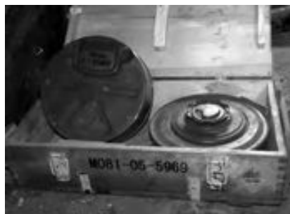
Anti-tank landmines observed in South Kordofan, May 2012.