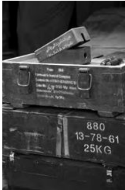
MK-4 landmines observed in South Kordofan, May 2012.