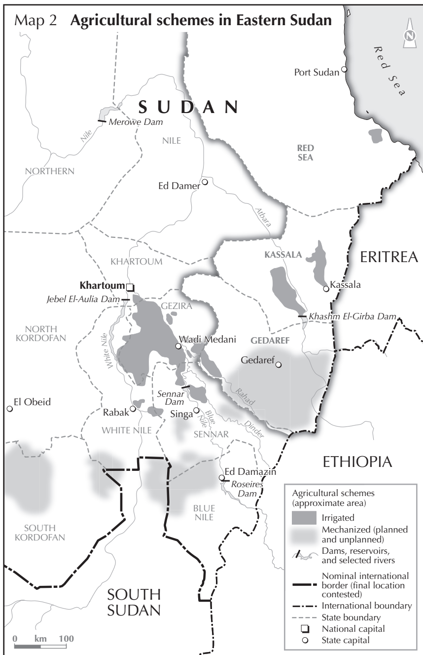
Map 2 Agricultural schemes in Eastern Sudan