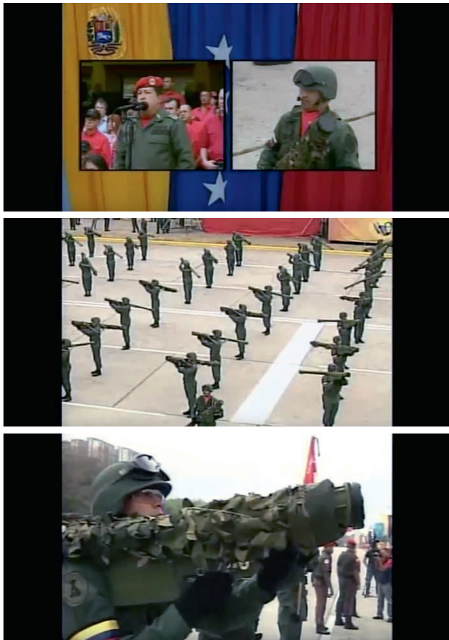
Image 8.1 Screenshots from video of Venezuelan military parade, 2009