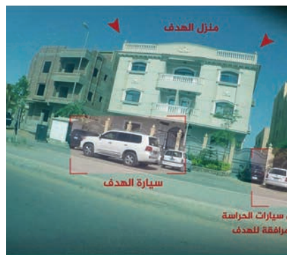
رصد تأمين منزل الهدف وموكبه الرصد العملياتاتي