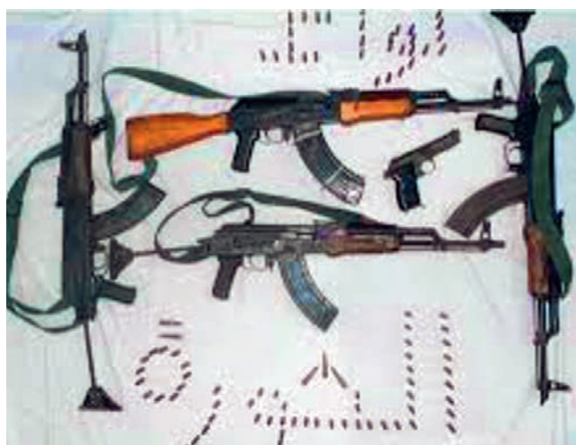
Propaganda photos posted on social media by Liwaa al-Thawra, featuring weapons and ammunition.