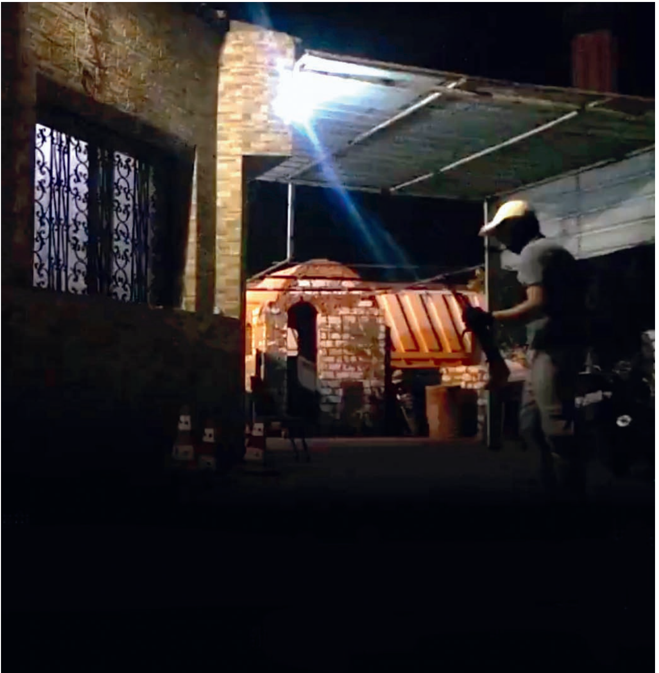
Screenshot from Liwaa al-Thawra propaganda video entitled ‘Revenge of the Freeman’.

content on their personal social media profiles. 21