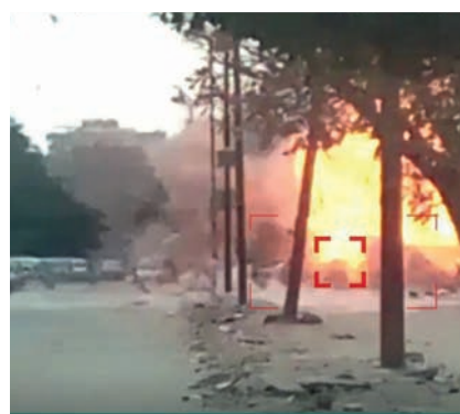
لحظة تفجير السيارة المفخخة فريق المتفجرات