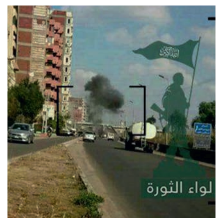
Collage of photo reports of attacks issued by Hassm (left) and Liwaa al-Thawra (right).