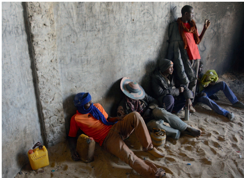
Photos 15–16 Puits Espoir ('Hope's Well'), mid-way between Agadez and Dirkou, is one of the main stageposts for travellers from Niger to Libya.