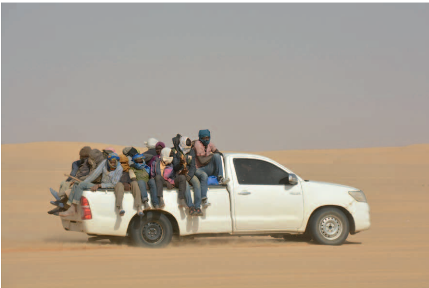
Photo 13 A smuggler’s truck, 2017. Smugglers prefer light, fast vehicles that can easily escape patrols.

With respect to Libya, the EU has adjusted its migration policy over time. In February 2017, it endorsed a memorandum of understanding between Rome and Tripoli’s GNA, whose aim is to ensure migrants stay in Libya (Toaldo, 2017). The GNA has little control over Libya’s land and maritime borders, however, such that this agreement would necessarily rely on risky engagements with militias that proclaim themselves coast guards or border guards. In July 2017, the EU announced an additional plan to support Italian efforts to curb migration, with EUR 136 million (USD 160 million) earmarked for Libya (Travère, 2017). The following month, Haftar suggested that blocking migrants at Libya’s southern border would cost the EU USD 1 billion per year over 20 to 25 years. In an effort to avoid being sidelined, he asked France, his closest