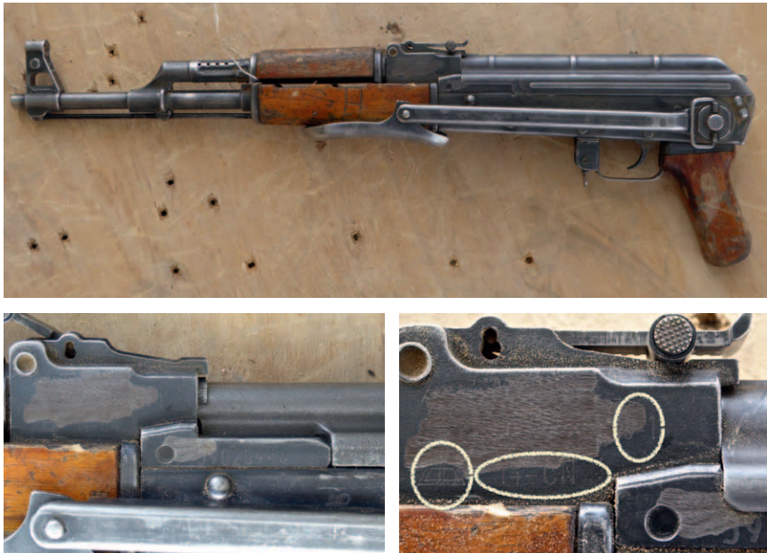
Photos 22–24 Close-up of the markings on the rear-sight block and on the receiver of the Type 56-1 rifle with the serial number 59020947, documented on 2 March 2017, in Dirkou, Niger. The bottom of the inscription ‘56-1’, of Factory 26 logo (26 inside a triangle), and of the inscription ‘14-CN’ remain visible despite abrasion marks.

The presence of the Type 56-1 rifle among those seized at the Libyan border is a further indication that Al-Mourabitoun, AQIM, and related armed groups were able to rely on a supply network that was directly connected with Libya (de Tessières, 2018, pp. 31–32). It also demonstrates that rifles of the 560 series were disseminated throughout the wider region, and it points to the possibility that some of the diverted rifles were transferred to Libya in violation of the UN arms embargo. 361 As of November 2018, the authors had not yet identified the first consignee in the transfer chain of the 560 series. 362