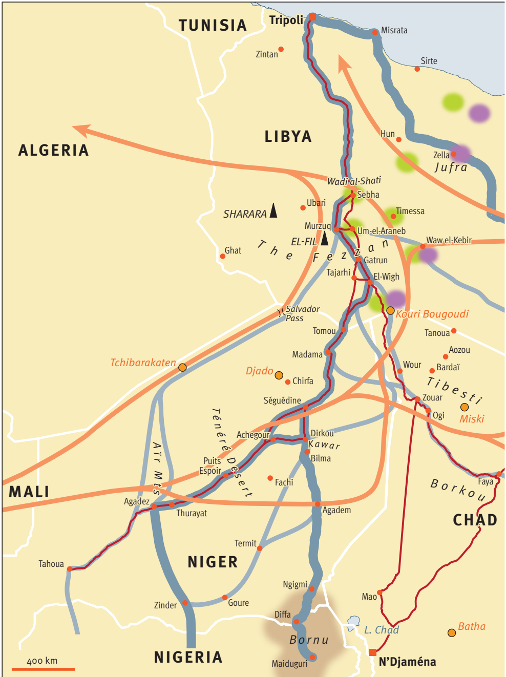
Map 1 Cross-border armed groups and routes across Libya's southern border