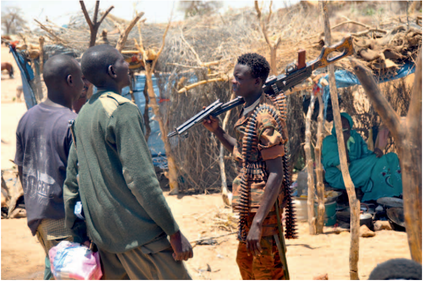
Photo 2 Government militia members in a North Darfur market.

declarations of support for Hilal may inadvertently have substantiated the accusation of collusion between Hilal and Haftar. 71