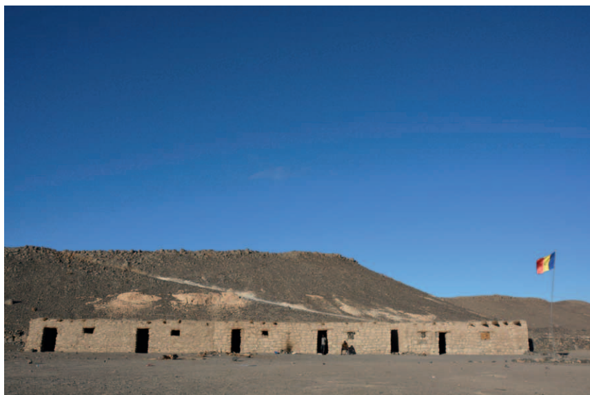
Photo 3 The military garrison in Zoumri, Tlbesti, northern Niger.