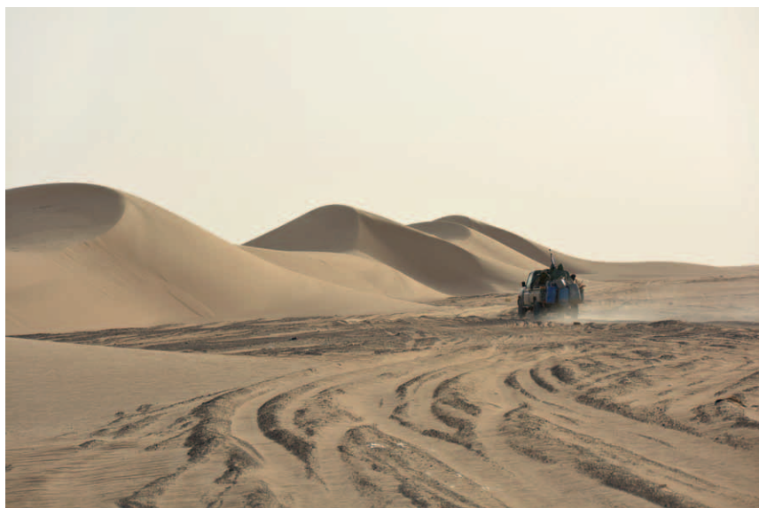
Photo 4 A military vehicle leading the weekly convoy between Agadez and Dirkou, norther Niger.

the competition among Niger’s three powers: 1) the ruling party, 2) the official opposition—which has a following in north-eastern Niger, and 3) the armed forces, which appear to be acting without government oversight in the north-east. 106