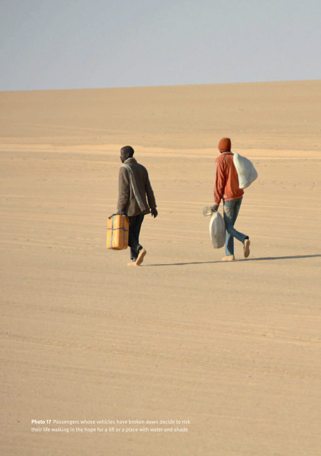
Photo 17 Passengers whose vehicles have broken down decide to risk their life walking in the hope for a lift or a place with water and shade