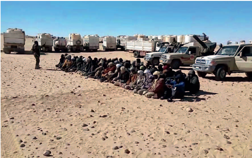
Photo 12 Libyan militia group Katiba 17 intercepts migrants in Kouri Bougoudi, on the Chad–Libya border, early 2018.

southern border. Since 2011, a growing number of migrants have been crossing the border, but insecurity in Libya has led sub-Saharan foreigners—who are particularly vulnerable—to travel on to Europe.