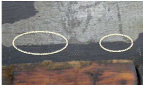
Photos 19–21 Close-ups of the markings on the rear-sight block and on the receiver of the Type 56-1 rifle with the serial number 56047966, documented on 2 March 2017, in Dirkou, Niger. The bottom of the Factory 26 logo (the number 26 inside a triangle) and of 'CN' (the abbreviation for China) are visible on the rear-sight block.