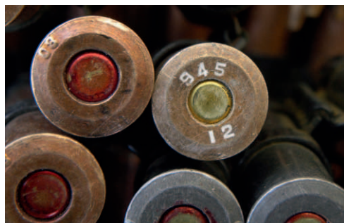
Photo 25 Chinese-produced 7.62 × 54R mm ammunition with the headstamp 945_12, documented on 2 March 2017, in Dirkou, Niger.

The authors documented 52 different lots of ammunition that contained 2,335 rounds of six different calibres (see Table 5). 371 Most rounds are almost certainly of Libyan origin, especially the military-type calibres. The 1,881 rounds of 7.62 × 54R mm ammunition documented belong to 31 different lots of production, three of which were manufactured in 2011 and 2012 (see Table 6 and Photo 25). Transfers of the rounds produced in 2011 constitute possible violations of the February 2011 UN arms embargo on Libya; deliveries of the ones manufactured in 2012 represent flagrant violations.