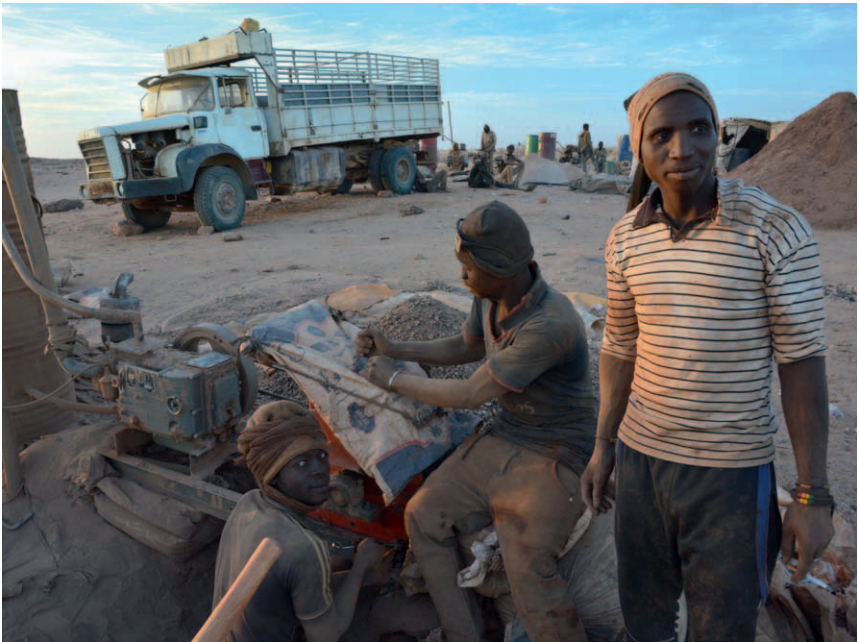
Photos 6–7 Gold miners in northern Niger.