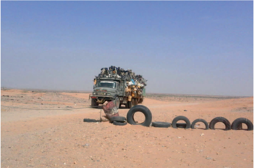
Photo 8 A truck carrying miners in the Djado region arrives at the Agadez checkpoint after the closure of the mines in early 2017.