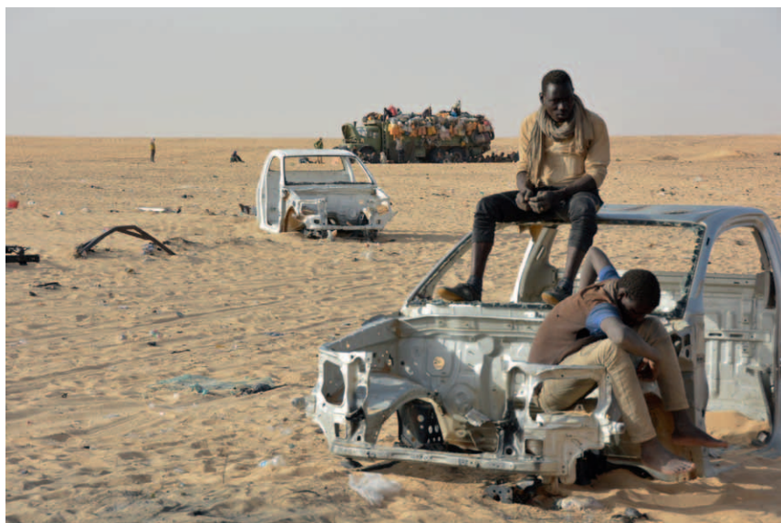
Photo 11 Migrants on the Niger–Libya road.

even transported loads from east of Agadez, in Tuareg territory, to Libya, thus boosting the importance of the Agadez–Dirkou–Libya corridor. 262