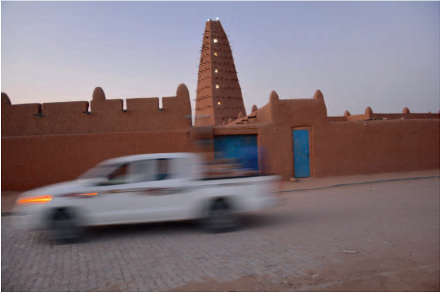
Photo 10 Agadez, Niger is one of the main hubs on the route between West Africa and Libya.

controlled most of the contraband. 258 Tubu and Tuareg drivers and intermediaries in this trade report that, starting around 2000, drugs were increasingly inserted into the cigarettes loads without their knowledge; when they realized that drugs had become part of the trade, they asked for and obtained a wage increase. 259