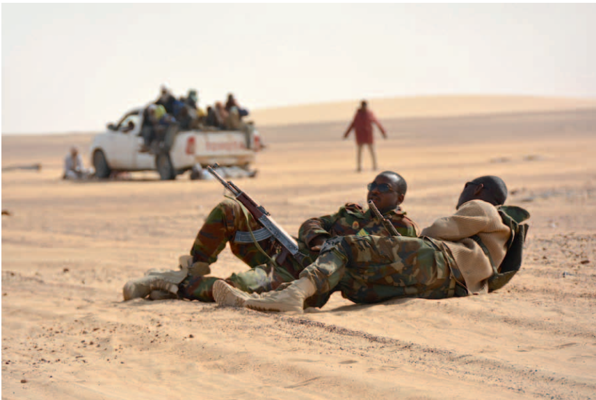
Photo 14 A break during the convoy between Agadez and Dirkou. Nigerien soldiers sometimes close their eyes to the presence of migrants in the convoy travelling to Libya.

Various observers characterize the plan and its implementation to date as incoherent, for two main reasons. First, its focus on Sudan as a transit country for migrants from the Horn of Africa seems to overlook the fact that it is also a main country of origin for refugees and asylum seekers, largely because of the continuous wars between Khartoum and rebel movements in the peripheries (Shah, 2017). The 40,000