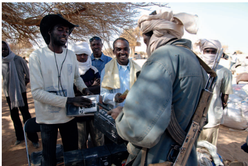
Photo 5 Traders coming from Libya to a rebel-controlled market in the Malha area of North Darfur, Sudan. Source: Jérôme Tubiana, 2007

2017, which allowed LNA to take control of the area' (UNSC, 2017b, p. 115; 2017c, pp. 14–15). At least 118 of Minawi's men were reportedly killed in the oil crescent in mid-2017 (UNSC, 2018b, pp. 83–84).