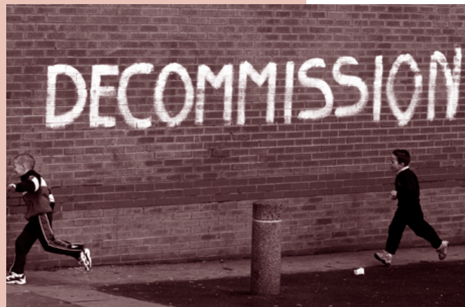
The Irish Republican Army's announced intent to decommission its weapons may be a step towards peace in Northern Ireland.

Critics are often correct in claiming that the numbers of weapons retrieved from armed opposition groups is merely symbolic and that rearmament is easy, whether with new supplies from outside sources or from secret arsenals that have not been surrendered. Nevertheless, giving up weapons as a signal of formally ending a war has a significant psychological impact. It can send a signal to combatants that fighting is over, inspire the authorities' confidence, and raise hopes of peace among the civilian population. This makes it an essential building-block in the restoration of a peaceful society.