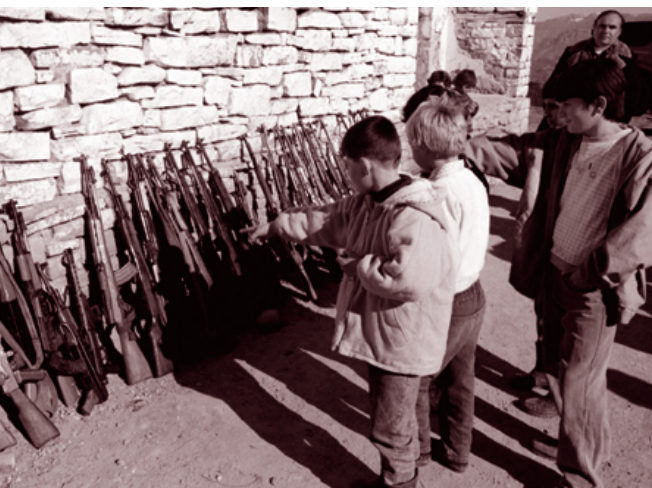
A new approach to weapons collection was tested in Albania, after 650,000 weapons looted from government stocks ended up in the hands of civilians.

After decades of economic mismanagement under the rule of Enver Hoxha, the population of Albania emerged from behind the Iron Curtain only to fall prey to numerous financial 'pyramid schemes'. Their collapse in 1997 triggered a