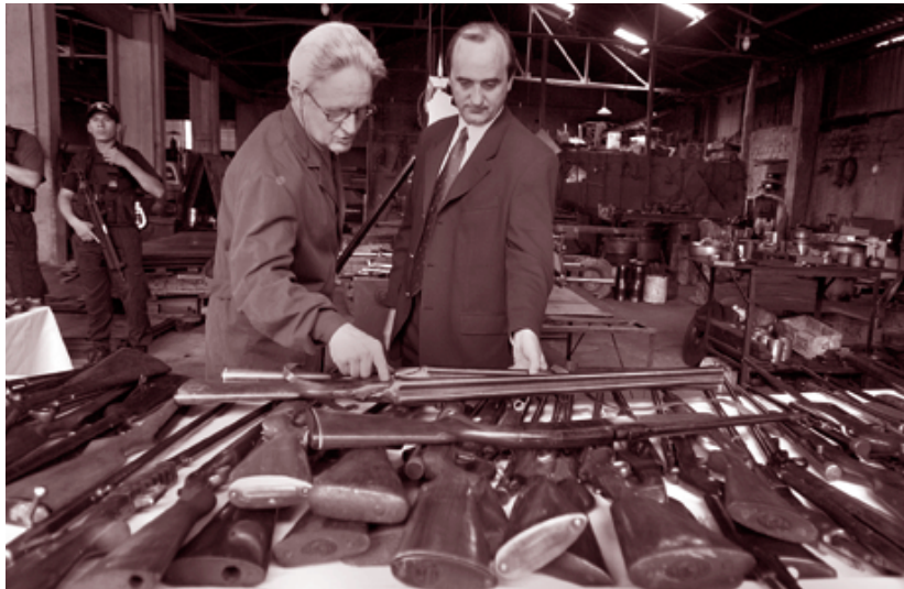
A technical expert shows a government official of Mendoza, Argentina, weapons slated for destruction during the Arms Exchange Programme.

The Arms Exchange Programme for Better Living Conditions took place in two phases—during the Christmas week of 2000 and in April and May 2001—in the Argentine province of Mendoza. The weapons collection programme was organized by the province's Ministry of Justice and Security in collaboration with non-governmental organizations. After a series of violent incidents involving firearms created growing insecurity in Mendoza, the Arms Exchange Programme was devised as one part of a larger strategy to improve public security in the region. The upsurge in crime in this province mirrored an exponential increase in armed violence in the country at large. Statistics revealed that the presence of arms in the community had measurable human costs, including: 12