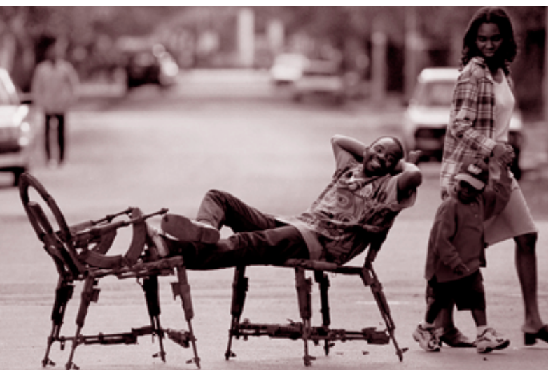
Mozambican artists put some of the weapons collected by the Tools for Arms Project to creative and practical use.

The Project targets former combatants and illegal arms holders in particular, encouraging them to turn in weapons in exchange for agricultural tools and other equipment. By August 2001, the TAE project had collected and destroyed approximately 200,000 different weapons and related items (Lusa News Agency, 2001). Local artists have turned some of the destroyed weapons into pieces of art, which have been exhibited and sold to raise money for the continuation and expansion of the project.