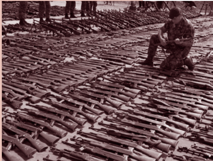
A British soldier inspects weapons turned in by the ethnic Albanian rebels in Macedonia during Operation Essential Harvest.