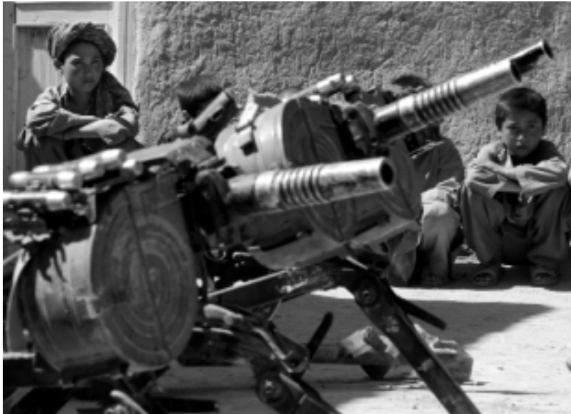
Afghan children squat next to grenade launchers handed in by local villagers to the UN as part of a voluntary weapons collection effort.

Other regions still remain virtual blank spots on the map of global stockpiles. China is an especially important, and potentially very large, unknown. Virtually no hard data is available on the Middle East, with the exception of Israel and Jordan.