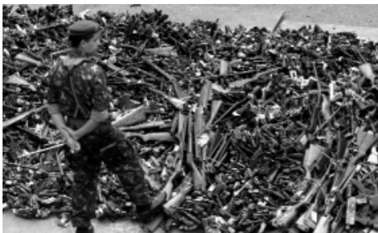
A Brazilian soldier guards a mountain of confiscated firearms to be destroyed by the government of Rio de Janeiro.

Continuous research has gradually improved knowledge about global small arms stockpiles. Global stockpiles, estimated last year to number at least 639 million small arms, continue to grow steadily. Regional dynamics can be very different. This chapter shows that some regions previously thought to have few small arms actually have large quantities in public hands. Other regions widely assumed to hold a lot actually have relatively few.