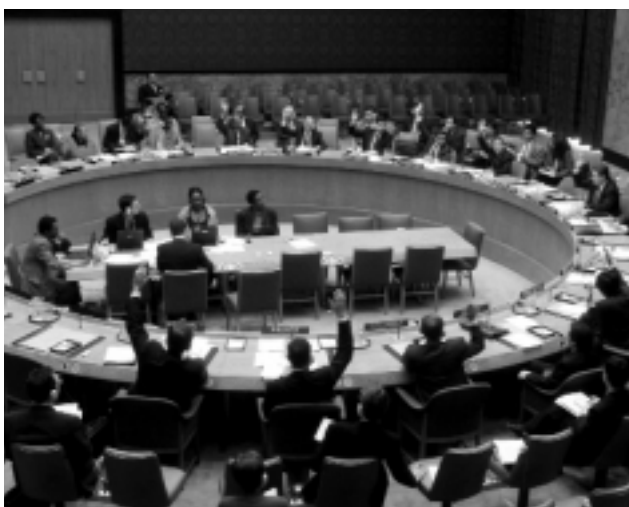
The UN Security Council votes unanimously to adopt Resolution 1343, re-imposing an arms embargo on Liberia because of its support for armed rebels in neighbouring Sierra Leone (7 March 2001).

A norm for the destruction of unwanted weaponry, though less well entrenched, also appears to be taking hold in southern Africa. Subregional cooperation, though quite extensive as a result of existing mechanisms, has not yet extended to small arms, though the potential for this appears strong as efforts to implement the SADC Protocol gather steam.