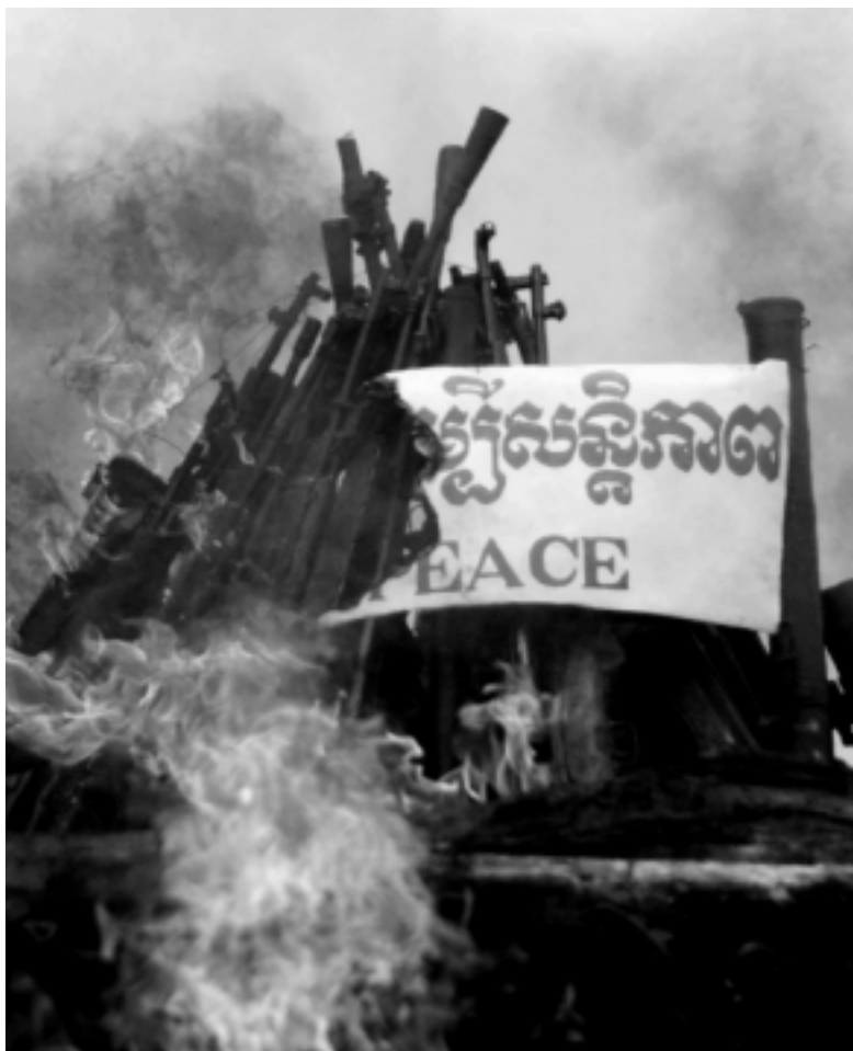
Nearly 7,000 small arms are burned in Cambodia to mark the beginning of the UN Small Arms Conference (9 July 2001)