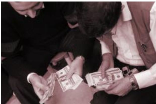
Brokers make their deals behind the scenes. Only 25 countries have regulations that could curb such illicit transactions.