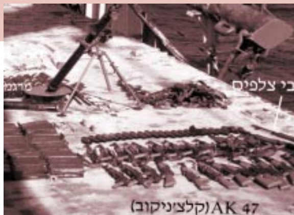
Israeli Defence Force labels identify assault rifles, ammunition clips, and mortar equipment on the deck of the Karine-A, seized in the Red Sea in January 2002 with 50 tonnes of mainly Iranian-supplied weapons and explosives for the Palestinian Authority.