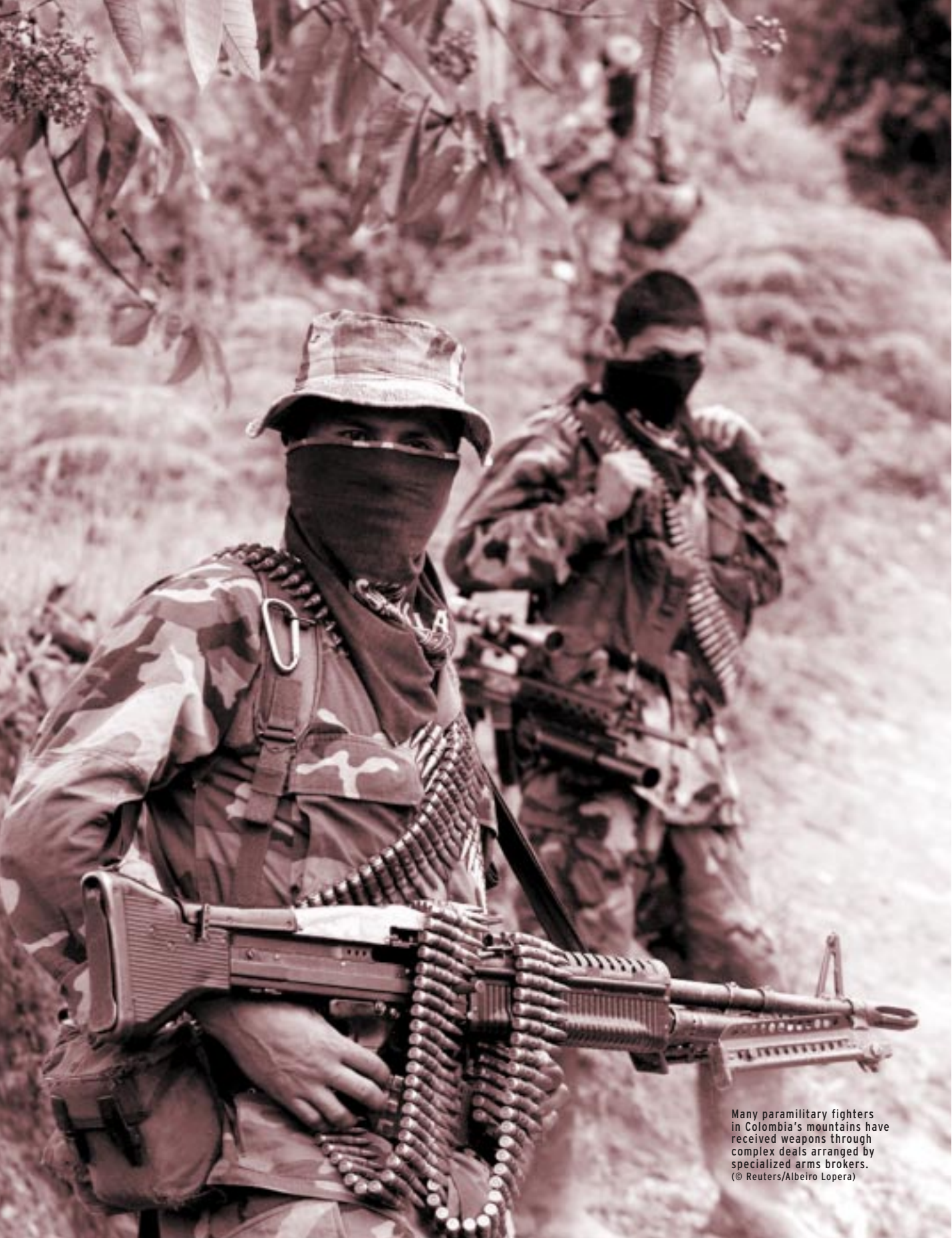
Many paramilitary fighters in Colombia's mountains have received weapons through complex deals arranged by specialized arms brokers.