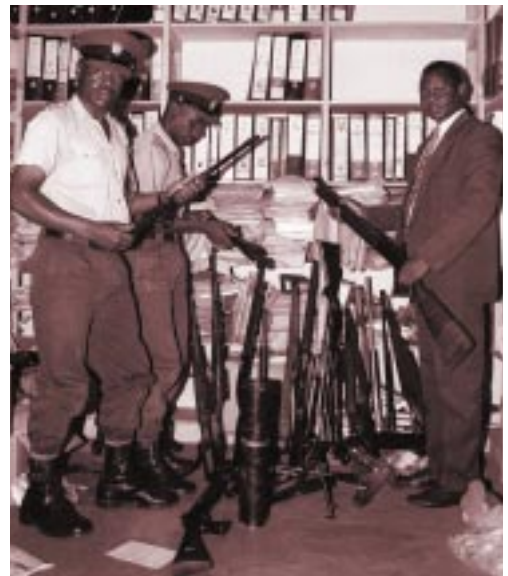
Zimbabwean policemen inspect weapons seized in March 1999 from three US citizens who allegedly worked as arms dealers in Congo, Tanzania, and Zimbabwe.

In seven countries—the Czech Republic, 29 Finland, the Netherlands, Norway, Romania, Sweden, and Ukraine—brokers subject to national jurisdiction must possess a licence even when they conduct operations from abroad, and the weapons they deal with neither enter nor transit national territory. In these countries, arms brokering requires explicit authorization even when the only link between the transaction and the controlling state is the nationality or permanent residence of the broker (Finland, 1990, sec. 2a.2; the Netherlands, 2003b, p. 6; Norway, 2003; Sweden, 1992, sec. 4; Ukraine, 2003, art. 1). 30 In Estonia, reference is made only to the location of the broker's operations, and not to the location of the transferred weapons. Brokering activities subject to licensing include, among others, those by Estonian service suppliers, both legal and natural persons, respectively through the economic activities of or in the territory of a foreign state. 31 Arguably, this provision covers the brokering of weapon transfers between third countries that is conducted abroad by Estonian nationals.