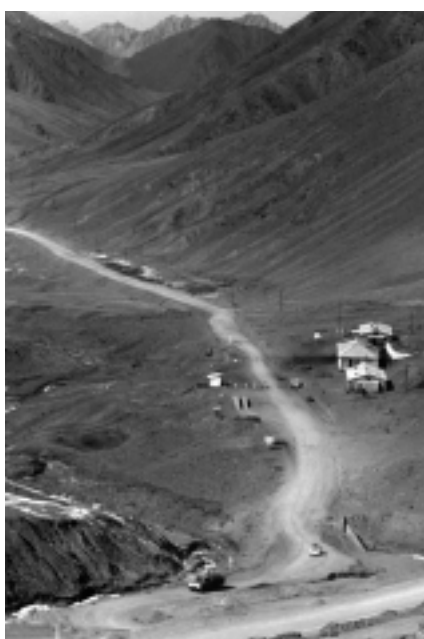
This remote Kyrgyz checkpoint at Kyzyl-Art poses a feeble threat to traffickers who navigate the windy road into and out of neighbouring Tajikistan.

While there appear to be no substantial arms flows, Kyrgyzstan is home to a number of arms caches, which are a cause for concern. Most caches were probably installed by activists from the Islamic Movement of Uzbekistan (IMU), who entered Kyrgyz territory in 1999.