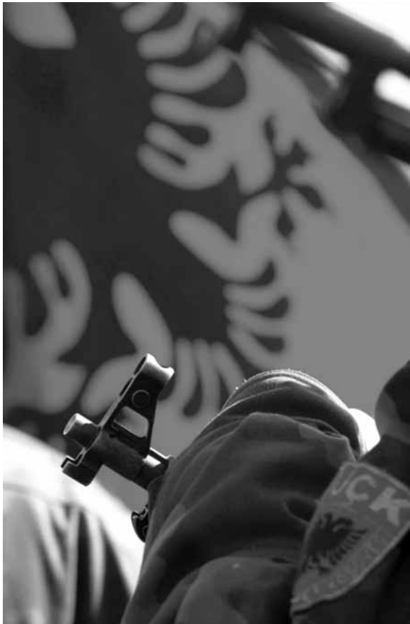
The Albanian flag waves behind the tip of a gun held by a KLA fighter during a ceremony in Likosane, Kosovo, in February 1999.