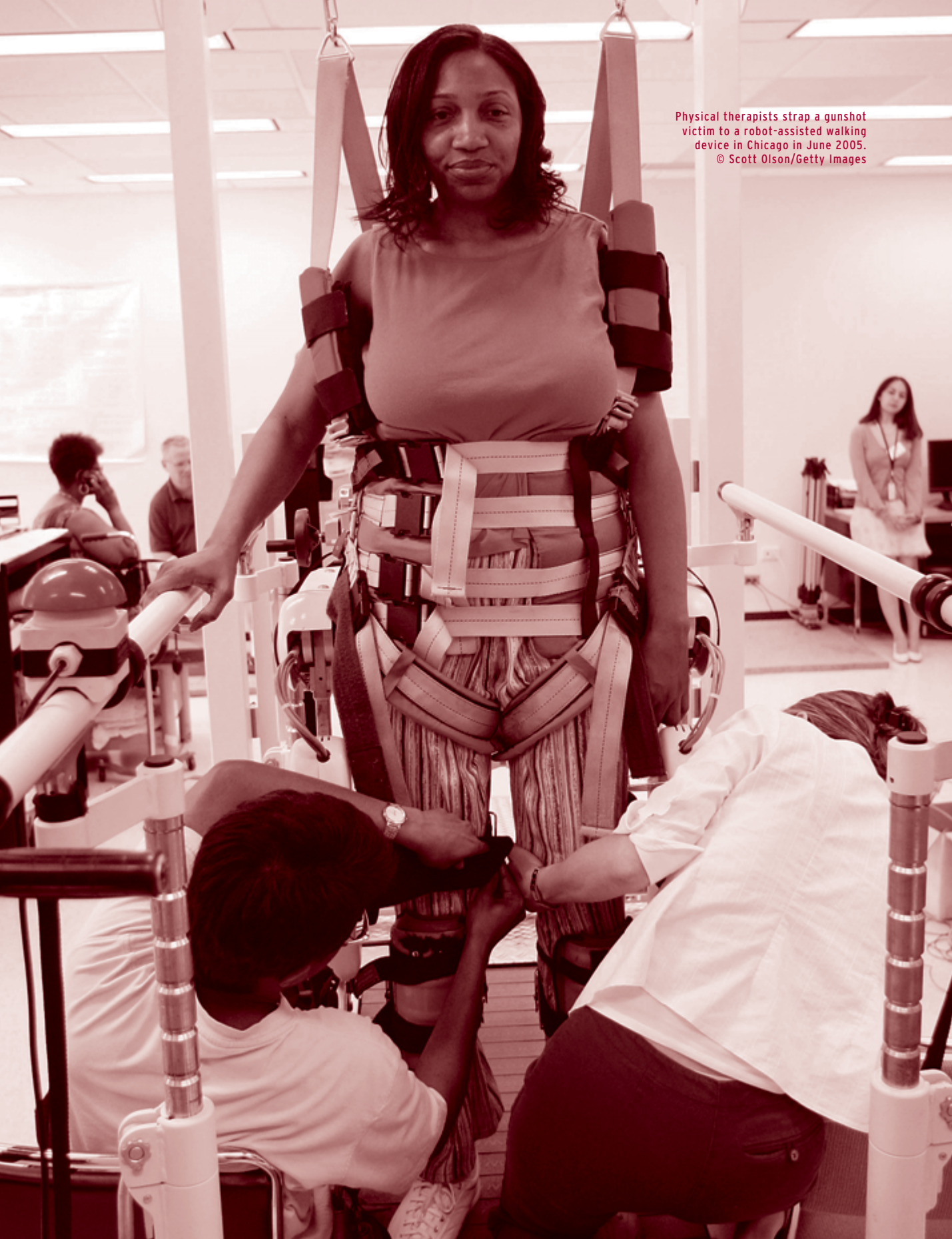
Physical therapists strap a gunshot victim to a robot-assisted walking device in Chicago in June 2005.