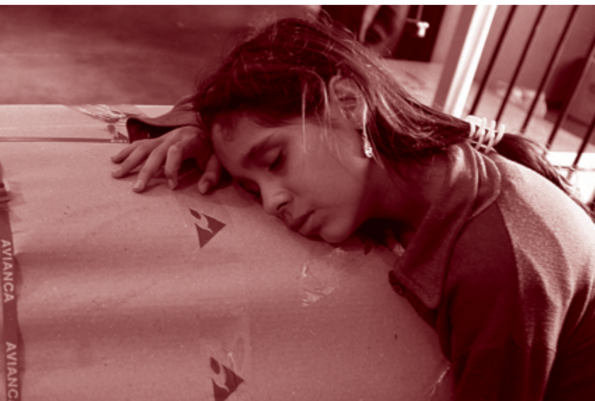
A child cries on the coffin of her father, a policeman who died of gunshot wounds in Colombia in August 2003.

Societal violence can impose an equally alarming burden. Costs for low-income countries may be underestimated, due to the small number of cases reviewed and the difficulty of comparing lost wages and income with those of high-income settings (WHO, 2004a, p. 14). The available evidence does suggest, however, that developing countries suffer more from violence than the industrialized world. Given the continent's high exposure to violence, the most