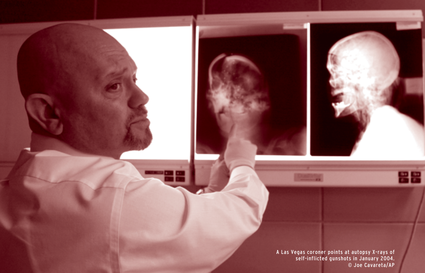
A Las Vegas coroner points at autopsy X-rays of self-inflicted gunshots in January 2004.