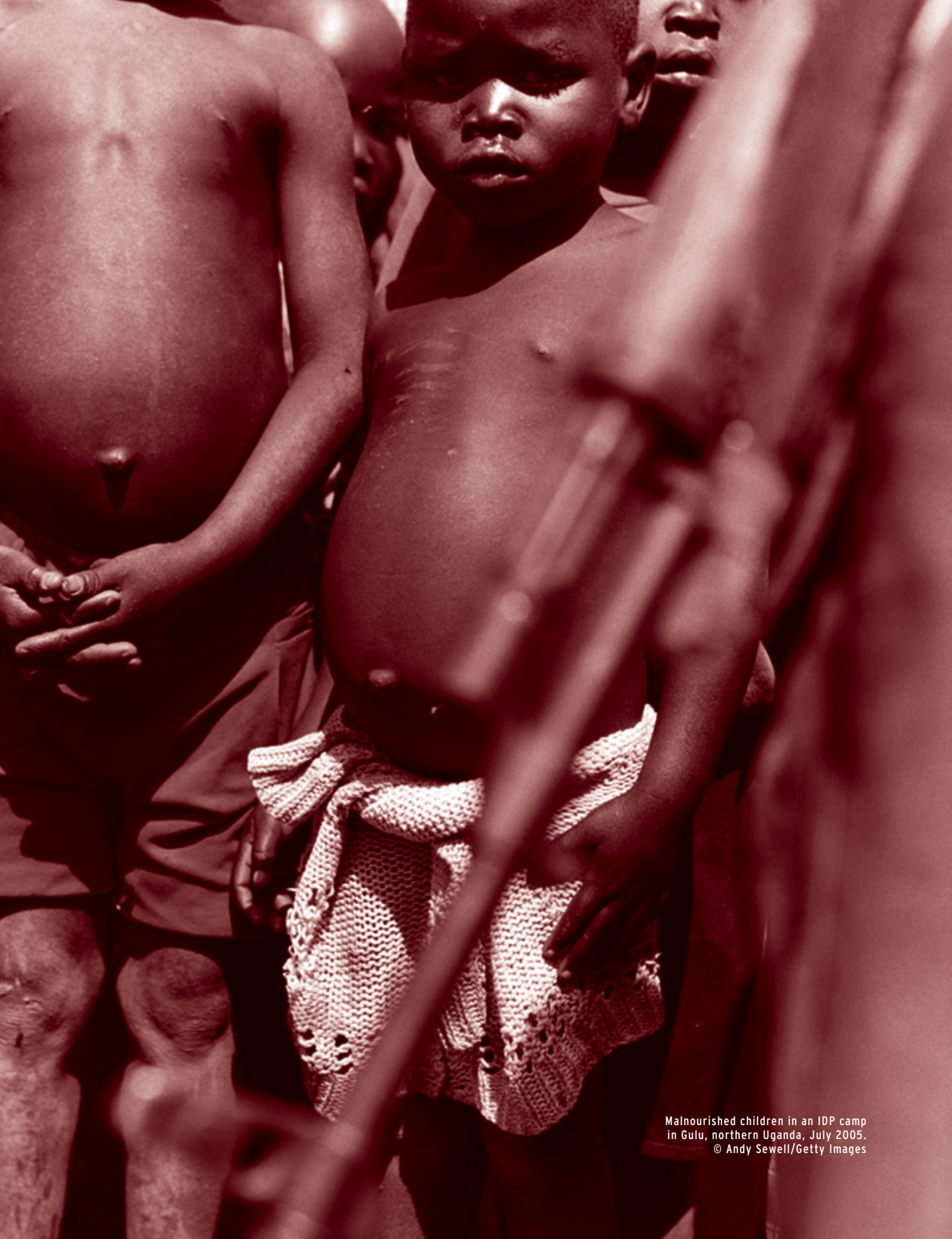
Malnourished children in an IDP camp in Gulu, northern Uganda, July 2005.