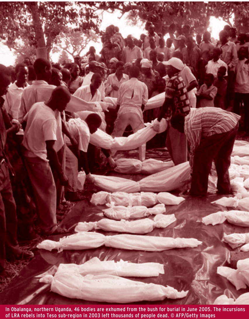
In Obalanga, northern Uganda, 46 bodies are exhumed from the bush for burial in June 2005. The incursions of LRA rebels into Teso sub-region in 2003 left thousands of people dead.

At first the LRA changed tactics and tried to expand its operations, but by 2003 this had resulted in high levels of disorganization (ICG, 2004, pp. 7–8). This change in circumstances is widely believed to be responsible for a series of peace talks between the LRA and government representatives since 2003. To date, the government has pursued a two-sided strategy of force and negotiation, albeit with more emphasis on the former.