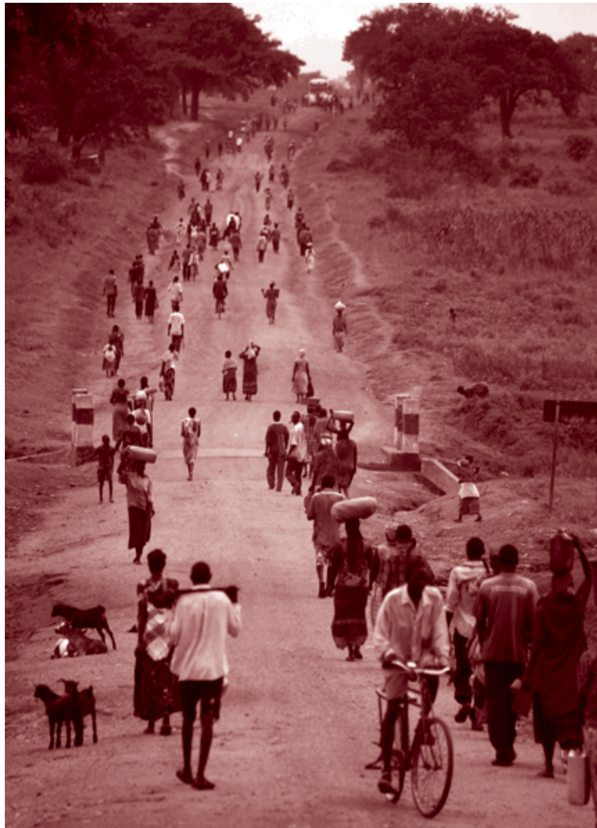
People on their twice-daily march from IDP camps to their fields—in constant danger of LRA attack. Kitgum, northern Uganda, November 2005.

Although the demand and supply of small arms in northern Uganda is closely related to the conflict with the LRA, the region also experiences high levels of insecurity whose origins lie beyond the conflict. These security problematics encourage general arms acquisition, which further strengthens the LRA's ability to acquire arms through trade and capture. In addition, experience in