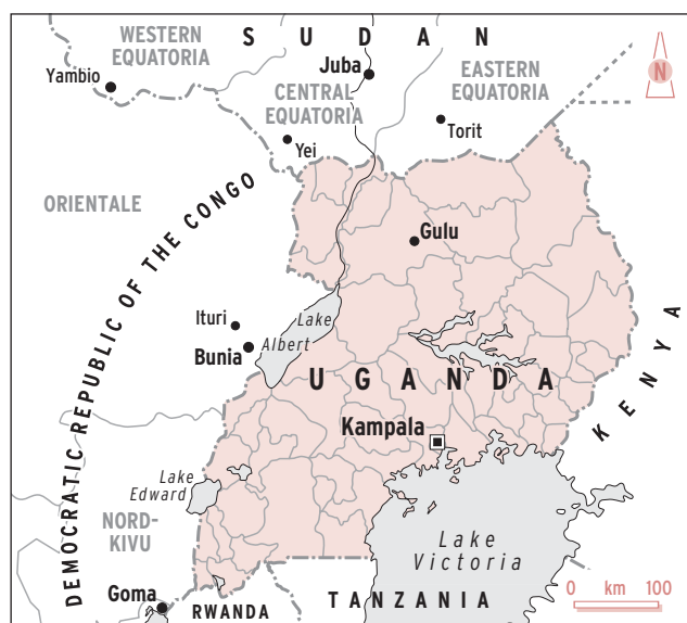
Map 11.2 Uganda and surrounding countries

Between 80 and 90 per cent of LRA fighters are abducted children.