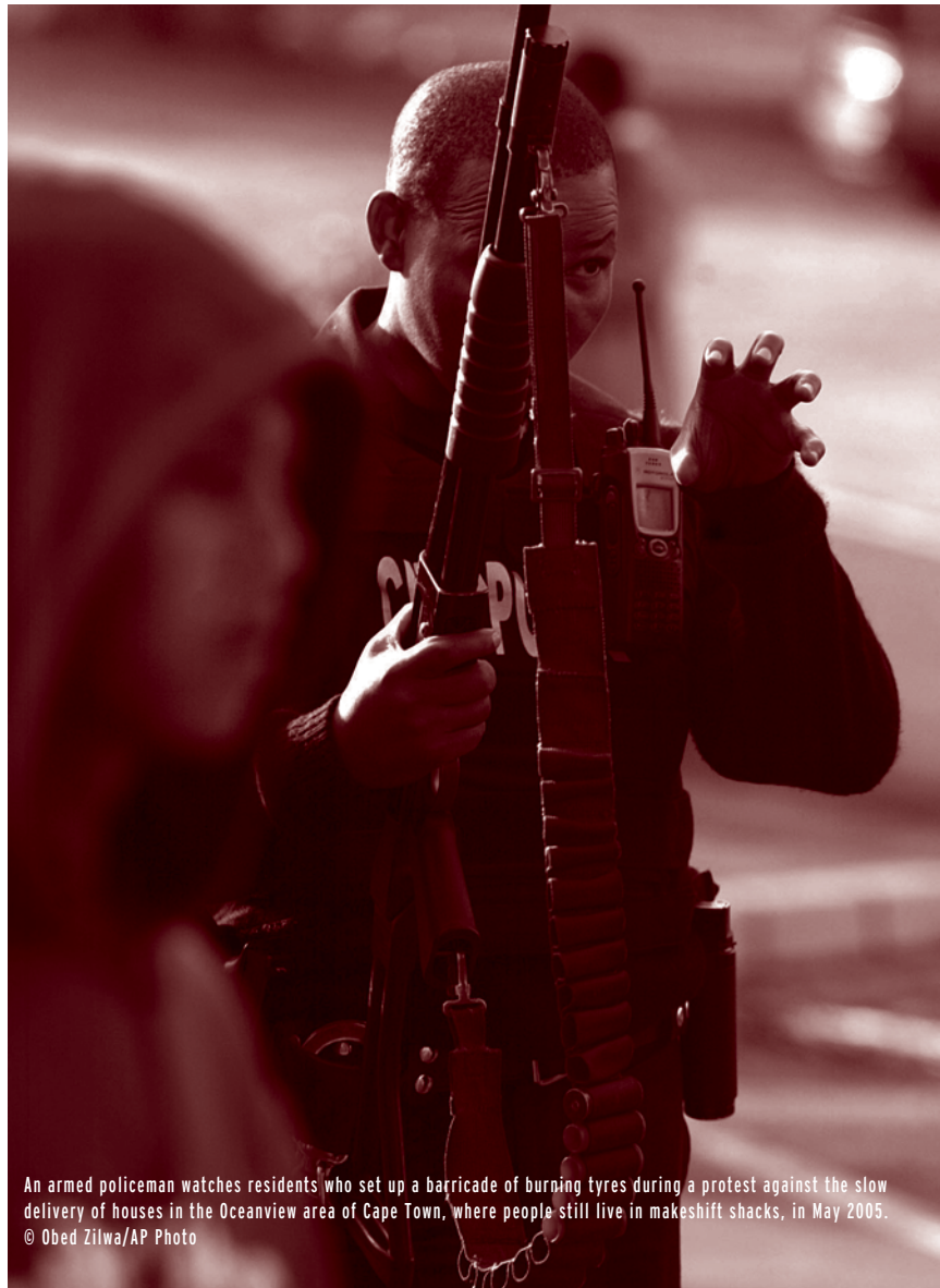
An armed policeman watches residents who set up a barricade of burning tyres during a protest against the slow delivery of houses in the Oceanview area of Cape Town, where people still live in makeshift shacks, in May 2005.

The reform of South Africa's firearm control laws was accompanied by a process of public consultation, which was initiated by the Secretariat for Safety and Security and the Parliamentary Portfolio Committee on Safety and Security in the late 1990s. In 1997 the minister of safety and security appointed a committee to carry out an '[i]nvestigation into a new Policy for the Control of Legal Firearms in South Africa'. Its brief was to 'produce progressive policy proposals which will contribute to a drastic reduction in the number of legal firearms in circulation