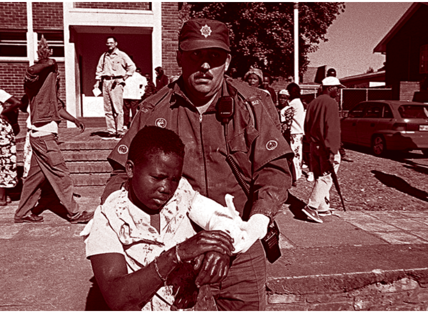
A South African police officer assists a 13-year-old girl after she was shot in the arm in Richmond, July 1998.

From 1 April 2002 to 31 March 2006 the SAPS reported an average of 26,230 cases of attempted murder per year, a minor reduction (6.2 per cent) compared to the 1 April 1994–31 March 1998 period, but there is no disaggregated data available to determine changes in the rate of attempted murder with a firearm. As reflected in Table 6.1, from 1 April 2002 to 31 March 2006 there was an average of 15,196 cases of illegal possession of firearms and/or ammunition per year, which was an increase of 11 per cent compared to the period 1 April 1994–31 March 1998.