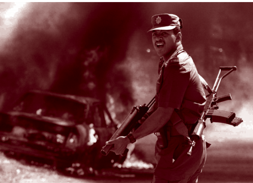
A South African police officer keeps his weapon at the ready as a vehicle burns behind him in December 1995, outside the Lamontville police station on the south coast.