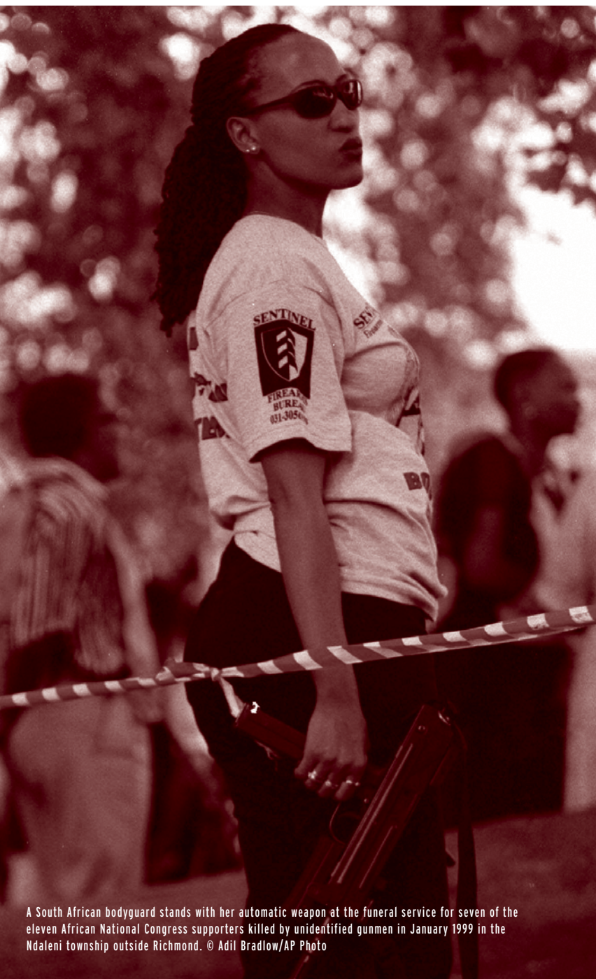
A South African bodyguard stands with her automatic weapon at the funeral service for seven of the eleven African National Congress supporters killed by unidentified gunmen in January 1999 in the Ndaleni township outside Richmond.

In practice, this means that security personnel are generally not permitted to carry their firearms when they are off duty. In addition, any business firearms may have multiple users. However, each user typically requires a competency certificate. The FCA