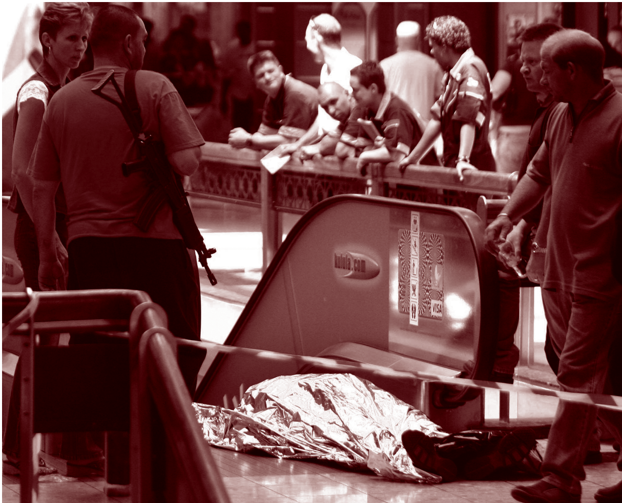
A robber lies dead after allegedly being shot by a private security guard during a cash delivery robbery in a shopping centre in Johannesburg, September 2006.