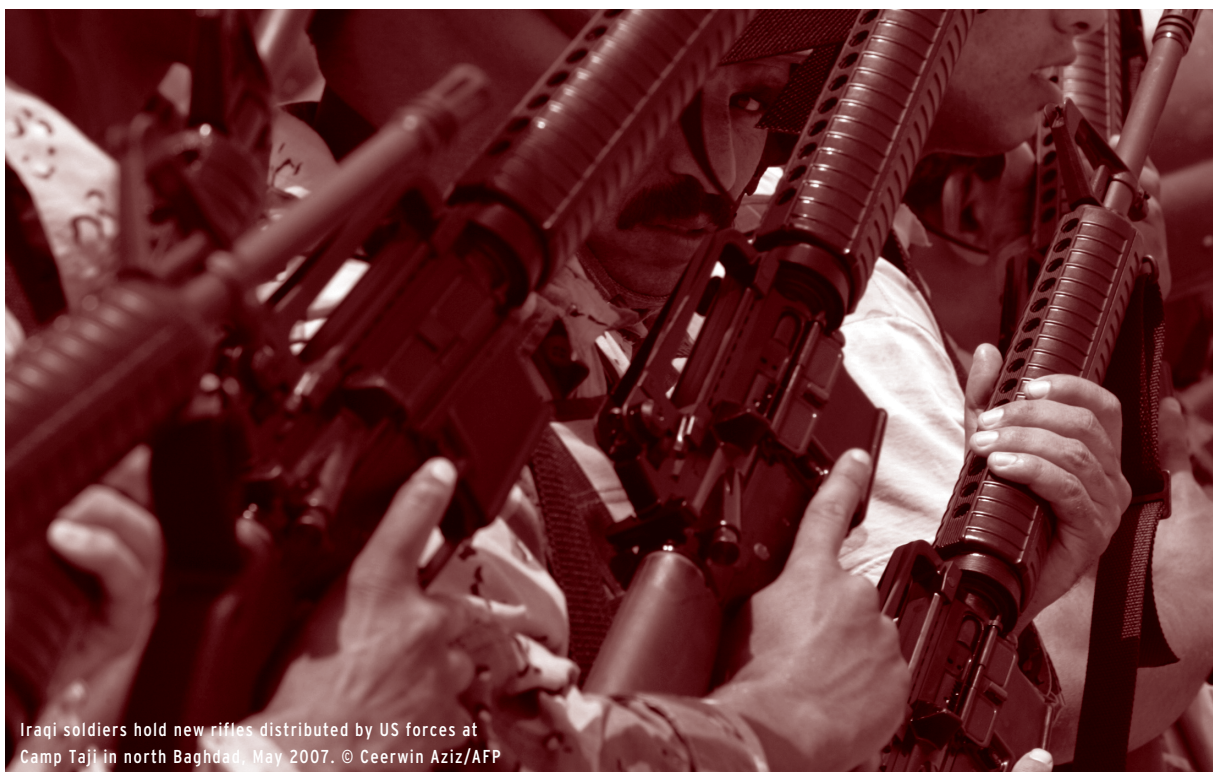
Iraqi soldiers hold new rifles distributed by US forces at Camp Taji in north Baghdad, May 2007.

Using Comtrade data alone, the chapter also identifies a 28 per cent increase in the authorized trade in small arms, light weapons, their parts, accessories, and ammunition from 2000 to 2006, after adjusting for inflation. One trend that partly explains the growth is that the US market significantly increased its imports of handguns, sporting guns, and ammunition during that period. The highest growth sector was small-calibre ammunition (less than 14.5 mm), the trade in which increased by USD 183 million, or 33 per cent, between 2000 and 2006.