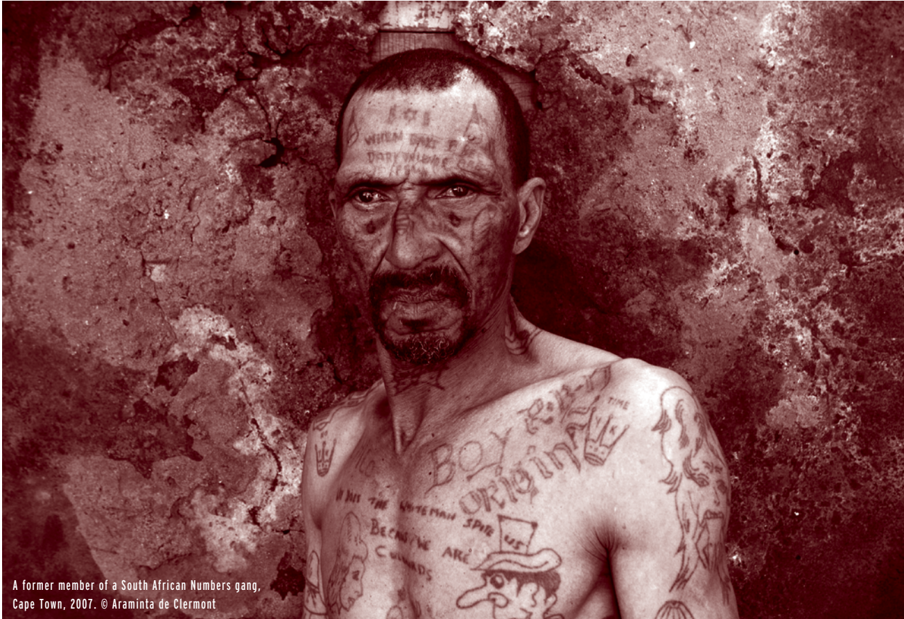
A former member of a South African Numbers gang, Cape Town, 2007.

through violence, 26s through cunning and theft (HRW, 1994, p. 52). Each gang also maintains its own baroque variation on a common foundation myth involving the 19 th -century anti-colonialist bandit Nongoloza, inspiring complex rituals involving imaginary but meticulously remembered Boer-war era uniforms and weaponry. Unlike in US prison gangs, membership is not determined by race or ethnicity, surprising given the two countries' similarly strong racial divisions. The Numbers are notoriously brutal, both towards their own initiates, who are often hazed to within inches of their lives, and towards the larger prison population, which the Numbers frequently exploit. Though the gangs often compete over resources and recruits, and occasionally engage in overt attacks against one another, they understand themselves to have complementary roles. 12 The Numbers system has thus propagated throughout the entire South African prison system, and for nearly a century has kept all other prison gangs from making more than minor inroads (HRW, 1994, pp. 51–52).