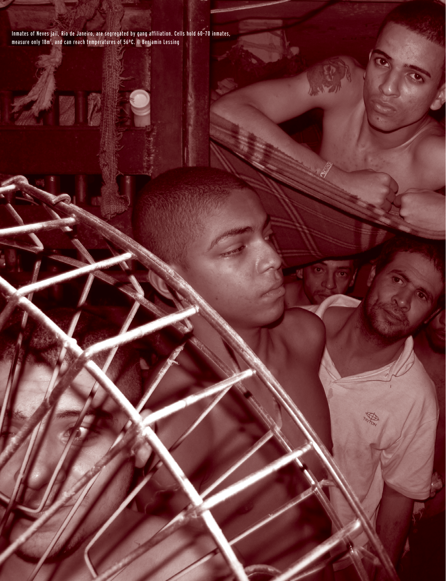
Inmates of Neves jail, Rio de Janeiro, are segregated by gang affiliation. Cells hold 60-70 inmates, measure only 18m 2 , and can reach temperatures of 56°C.