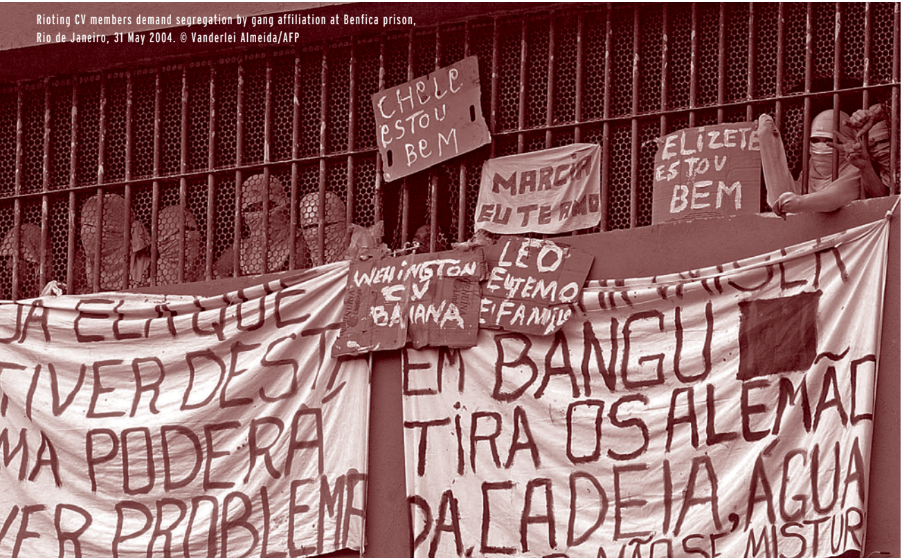
Rioting CV members demand segregation by gang affiliation at Benfica prison, Rio de Janeiro, 31 May 2004.

The real beneficiaries of the government's ill-conceived policy may have been the common criminals of the LSN wing. In a spectacular example of unintended consequences, these inmates learned and adopted many of the leftists' organizational and collectivist tactics, forging a strong group identity. 17 Refining and adapting these tactics over time, the group known initially as the Falange LSN (LSN Gang) would, within a decade, not only dominate Rio de Janeiro's prison system, but wield armed control over the majority of the city's favelas and a near-monopoly on the city's booming retail drug market.