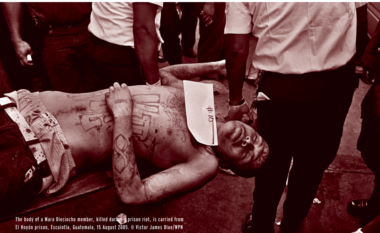
The body of a Mara Dieciocho member, killed during a prison riot, is carried from El Hoyón prison, Escuintla, Guatemala, 15 August 2005.

This suggests that, on the margin, prison gangs' access to and use of firearms is likely to grow with their size and strength. On the supply side, a stronger, larger, richer gang is likely to have more extensive contacts—and standing bribery relations—among corrupt guards; more economic resources to pay bribes; and more associates on the outside who can obtain weapons. On the demand side, while both gangs and individuals may seek out guns for defensive purposes, gangs are far more likely to find advantageous the kind of prison-wide disturbances that firearms can help provoke. Riots offer opportunities for escape and score-settling; instigating lockdowns can provide protection or buy time; hostage-taking can lead to negotiations and improved prison conditions. As a gang's resources grow, it is more likely to be able to employ violence and disorder in strategic ways.