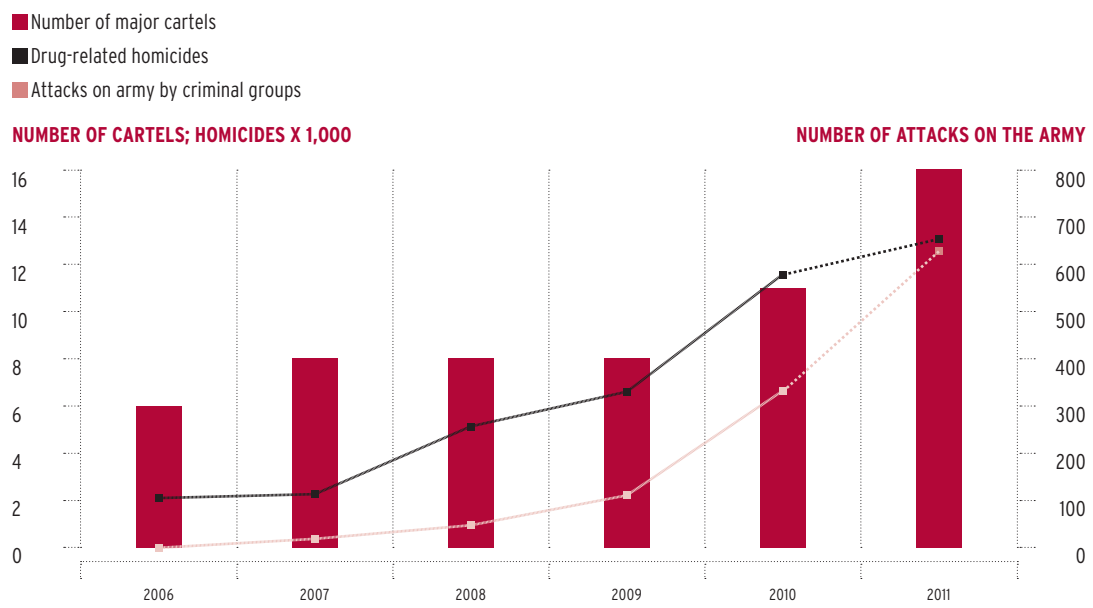
Figure 2.5 Cartel fragmentation and drug-related violence, 2006-11

Note: The 2011 figures for homicides and attacks are yearly estimates based on data for the period January-June.