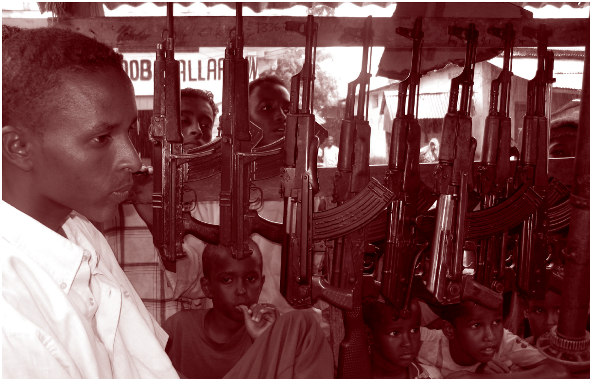
An arms dealer who began trading at the age of ten at his stall in Bakara market, Mogadishu, Somalia, June 2006.