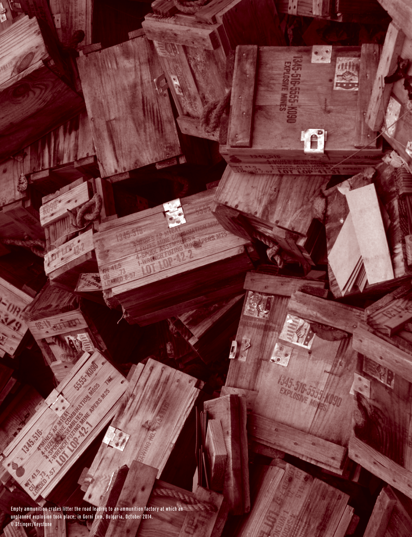
Empty ammunition crates litter the road leading to an ammunition factory at which an unplanned explosion took place, in Gorni Lom, Bulgaria, October 2014.