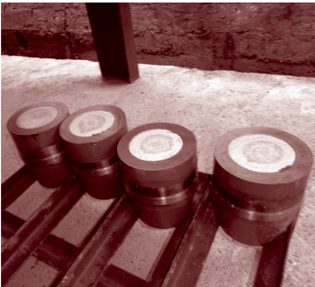
High-explosive projectiles are processed for demilitarization using an industrial bandsaw (top), and the resulting opened shells are transported away on forklifts, for the removal of energetics (bottom), ULP Mjekës, Albania, 2011.

Secondly, it is unclear to what extent MoD-owned plants such as Mjekës and TRZ Kragujevac can become commercially viable and competitive in the open market. Such facilities often function as military units, featuring older technology and lower production volumes than their private, civilian competitors. In particular, they are not able to adapt to the constraints of regional or international demilitarization markets, where commercial considerations play an increasingly important role. The NSPA completed US-funded destruction activities at the ULP Mjekës and Gramsh plants at the end of December 2014. At the time of writing it was unclear how they would pursue their demilitarization activities without donor assistance.