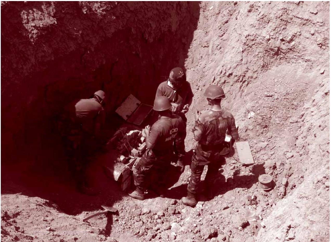
Members of an explosive ordnance disposal team prepare a batch of high-explosive projectiles prior to open detonation at the Krivolak range near Mushanci, Macedonia, 2011.

Another best practice example is Montenegro, where the MoD reinvested more than EUR 1.2 million (USD 1.8 million) obtained mostly from the sale of scrap metal—generated by the destruction and recycling of heavy weapons systems—into ammunition demilitarization (OSCE, 2014). Croatia 22 and Slovenia, among other SEE states, have also covered all or part of the costs of conventional ammunition destruction, infrastructure refurbishment, or depot construction.