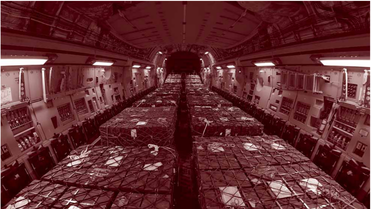
During Operation Impact, a Royal Canadian Air Force aircraft—photographed in the Czech Republic—transports pallets of military supplies donated by Albania and the Czech Republic to security forces in Iraq, September 2014.

National export reports do not disaggregate sales of surplus from sales of new ordnance, yet RASR countries have provided some information. Bulgaria noted that it sold more than 5,000 tonnes of excessive ammunition in 2011, more than 8,775 tonnes in 2012, and 2,208 tonnes in 2013, with the latter figure representing about 31 per cent of its estimated 7,075 tonnes of surplus in 2013 (Bulgaria, 2012, slide 4; 2013, slide 5). The Croatian MoD reported sales