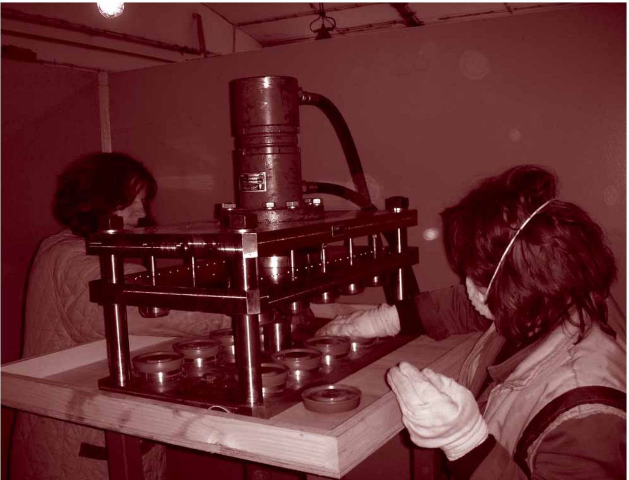
Trained staff dismantle anti-personnel mines at TRZ technical overhauling facilities in Kragujevac, Serbia, April 2007.

Large government-owned facilities tend to declare their capacity figures and approximate demilitarization costs. As these are context-specific, care must be taken when making comparisons between nations. Albania's main plant—ULP Mjekës—has a total capacity of more than 5,000 tonnes per year across a broad spectrum of ammunition types, at approximately EUR 500/tonne (USD 565/tonne) (NSPA, 2014, slide 23). The Serbian MoD's TRZ plant in Kragujevac reportedly dismantled approximately 4,000 tonnes of ammunition per year between 2006 and 2010 (Serbia, 2011a, slide 4; 2011b, slide 5). Serbia has repeatedly stated that the plant is underutilized and that it could increase its capacity to anywhere between 6,000 to 10,000 tonnes per year by opening additional demilitarization lines (Serbia, 2011b, slide 13; 2011d, p. 3). In 2011, the plant reported an average demilitarization cost of EUR 780 (USD 1,080) per tonne, but calculated that economies of scale linked to the potential capacity increases could bring the cost down to