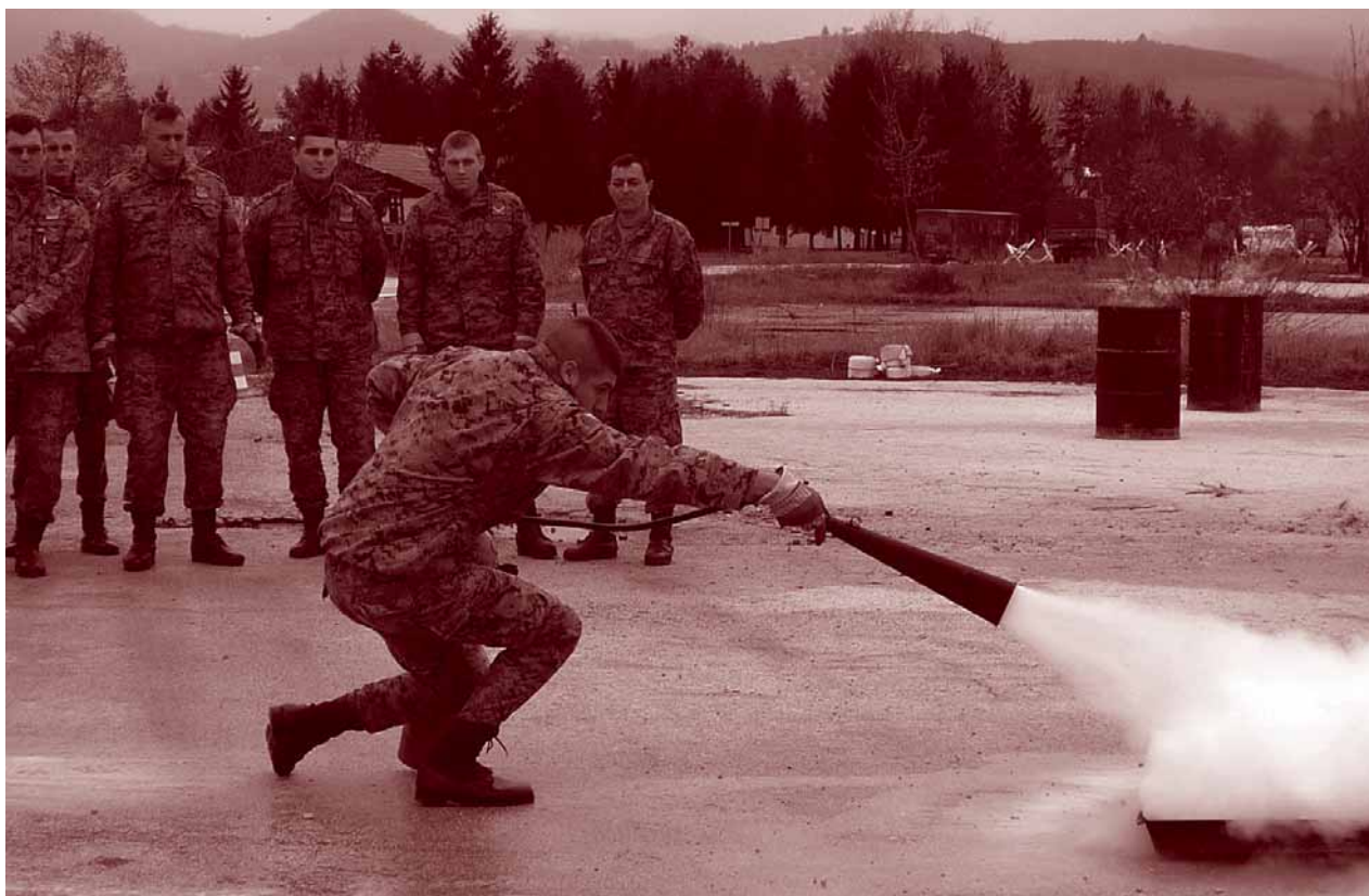
A participant is trained in firefighting skills during the Ammunition Transportation Safety Course held at Rajlovac, Sarajevo, Bosnia and Herzegovina, mid-2014.

Long-term capacity building requires long-term commitment. Yet few donor countries are willing to invest the human, material, and financial resources needed over several years to build comprehensive stockpile management capacity in any SEE country, let alone the region.